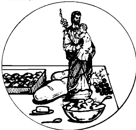
St. Joseph Table