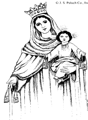
Our Lady of Mount Carmel

Please come out and support this wonderful tradition in our Parish.