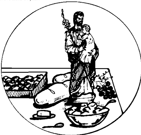
St. Joseph Table