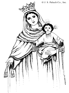
Our Lady of Mount Carmel